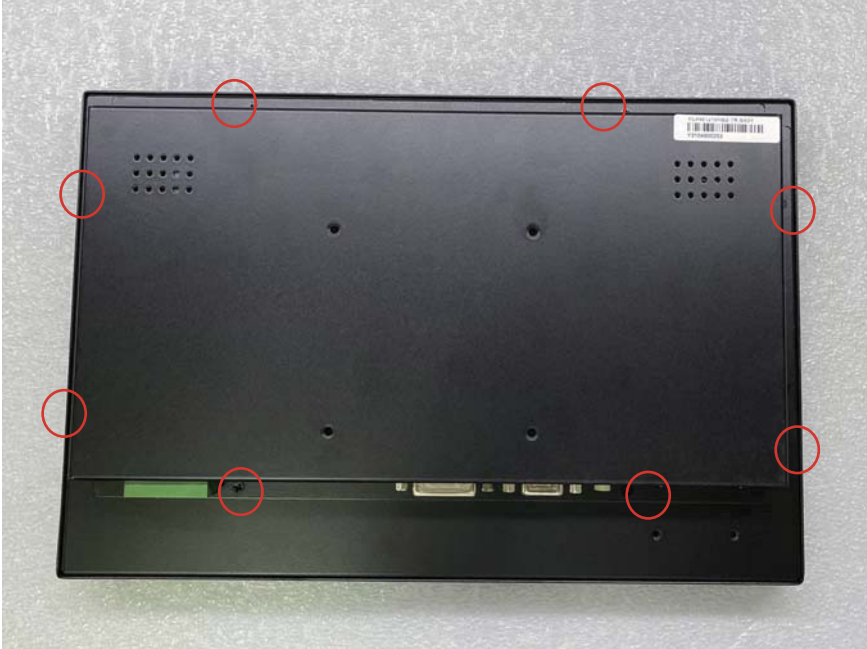
(8) Rescrew 8 of countersunk screw back.