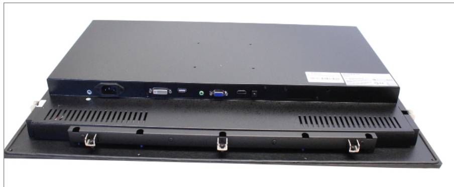
Rear View I/O