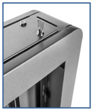
Keyed-Alike Cam Locks