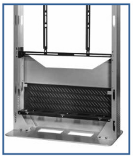
Component Tray & Shelf