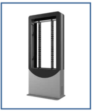
Custom Colors Available