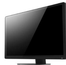
[ BLACK ]