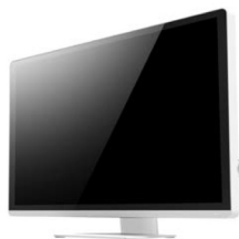
[ WHITE ]