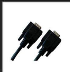
VGA Cable (VGA Ver.)