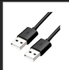
USB-A - A Cable (For Touch)