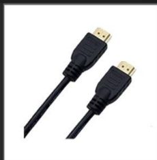
HDMI A-A Cable (HDMI Ver.)