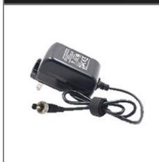
12V 3A Power Adapter