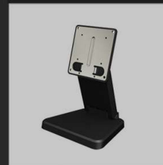
VESA 75mm Bracket