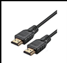
HDMI A to A Cable