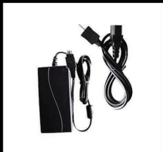
15V 4A DC Power Adapter