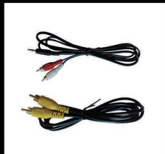
Audio & Video Input Cable