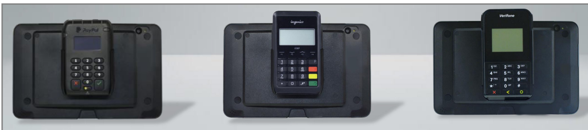
mPOS Jacket for Miura M010