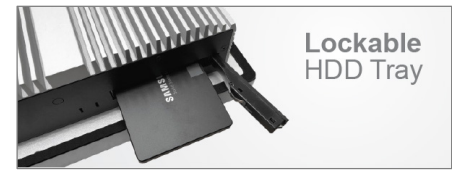
Lockable HDD Tray