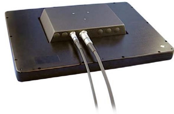
Pictured TOP: Standard DOD Series with Power and RGB Inputs.