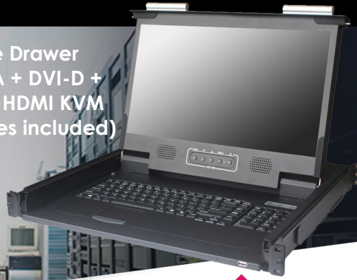
(USB Port for device access)