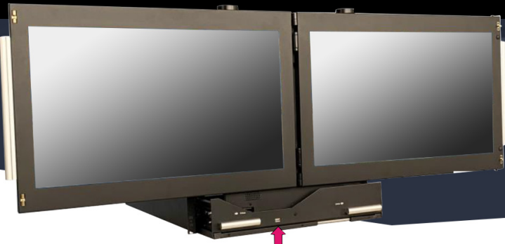
(USB Port for Device Access)