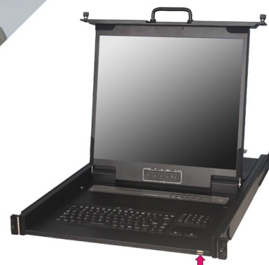
USB port for Keyboard/Mouse