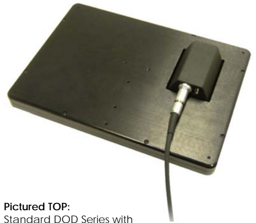
Pictured TOP: Standard DOD Series with LVDS and Unsealed USB Inputs.