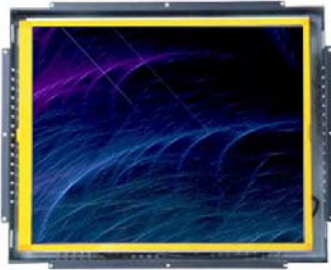
Open Frame Type