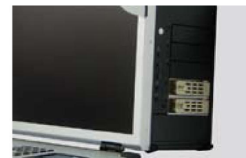
7x 3.5" removable HDD trays for data storage