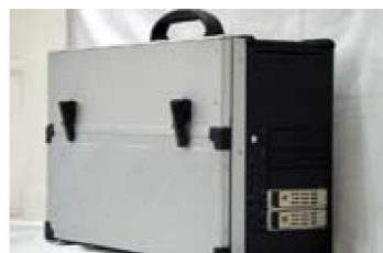
Rugged keyboard-visor for LCD protection