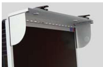
Integrated folder-down visor shade