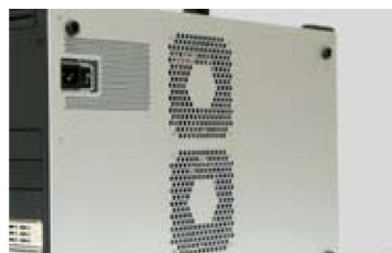
Dual high CFM fans for efficient thermal control