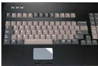
105-Key keyboard with 2-button touchpad