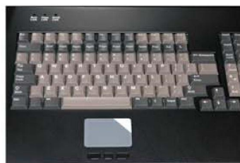
117-Key SUN keyboard with 3-button touchpad