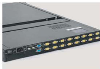
D-Sub 15 pin 16 ports with console